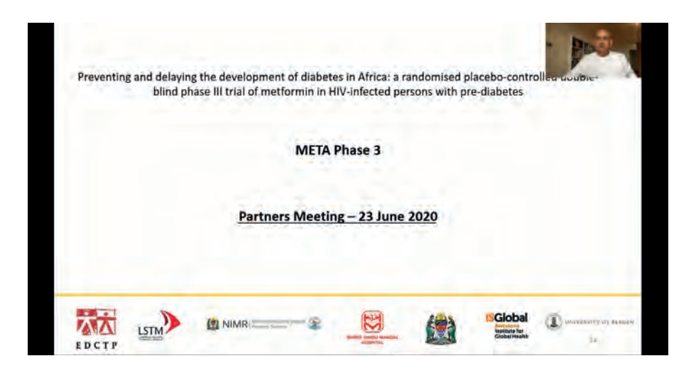
META Phase 3 virtual kick-off meeting, 23 June 2020

We held a virtual 'kick-off' meeting for project partners on 23 June, attended by partners (LSTM, NIMR, Hindu Mandal, IS Global and University of Bergen), members of our international steering committee, EDCTP and MERCK. Given the many challenges we overcame with phase 2 and that the number of study sites was increased, we are confident that phase 3 will be done to a very high-quality standard. The trial follow-up will be for 3 years per patient, although we will be looking to set up a cohort for a 10+ year follow-up. Special thanks to Merck for attending the meeting and for such glowing praise about our phase 2 trial!