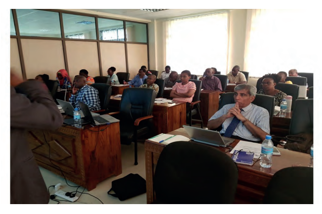
Stakeholders meeting, Tanzania

The Tanzania NCD Alliance and the Uganda Diabetes Association are supporting us to identify expert patients to sit on our national and international steering committees.